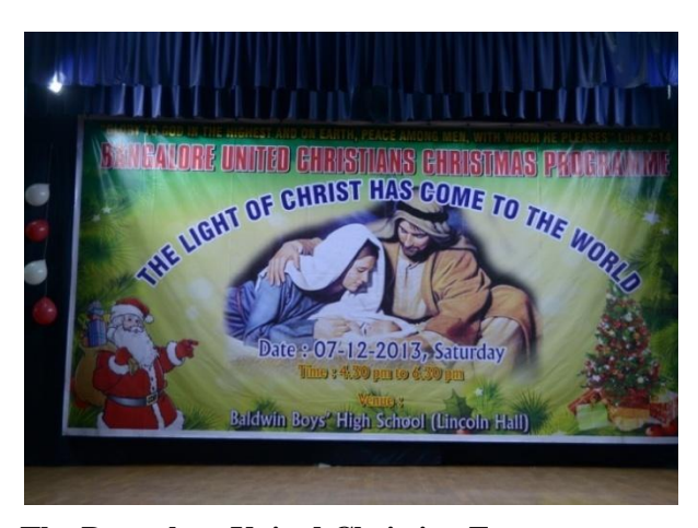
The Bangalore United Christian Forum organized Christmas