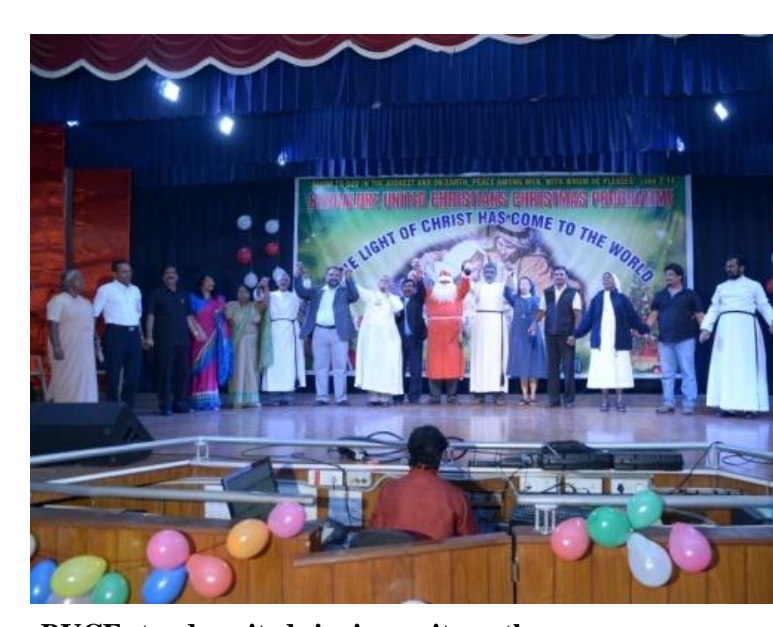
BUCF stands united singing unity anthem