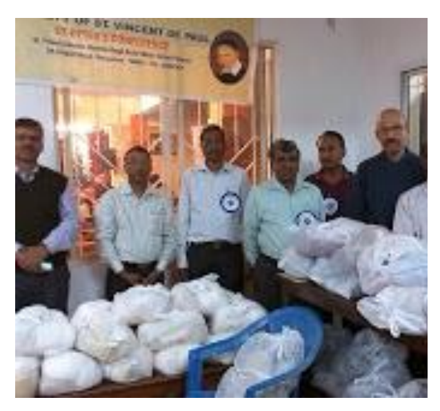
St.Peter's Church (Vde Paul) distributes provision for the adopted families as Christmas gift