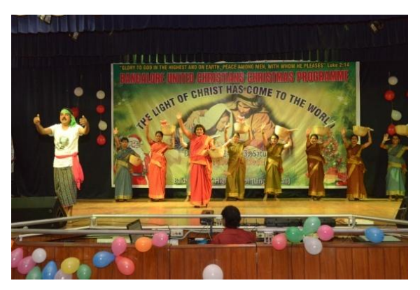
The Methodist Baldwin Boys' School staff performing an excellent piece of fisher women dance at the BUCF's Christmas event